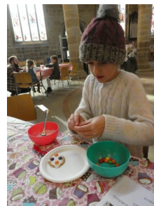
icing painters' palette biscuits