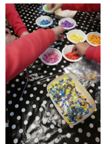
making a prayer bracelet

The Y5 class from St Mary's came for a Signs and Symbols workshops. During the workshop they had an opportunity to find out about the cathedral and how it is used in Christian worship with a focus on how the Psalms are used. They role played a baptism and the Eucharist service. They learnt about prayer and found out how some people use candles, beads or the labyrinth during prayer. They had opportunities to walk the labyrinth, make prayer beads and find out more about the cathedral using the Cathedral Quest.