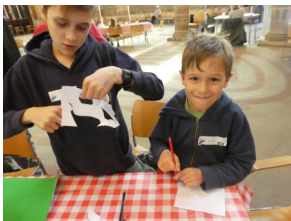
cutting out sheep to put on a big Good Shepherd picture

Our theme for this month's Messy Cathedral was St Luke as the session took place on the Saturday after the feast day of St Luke. We explored how Luke was a doctor as well as a writer of one of the gospels. We looked at the tradition that he was an artist and made our own icons and iced biscuits to look like painters' palettes. We also thought about the Parable of the Lost Sheep as it is one of the most well known parables in Luke's gospel.