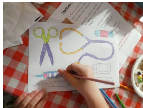
making a doctors' bag