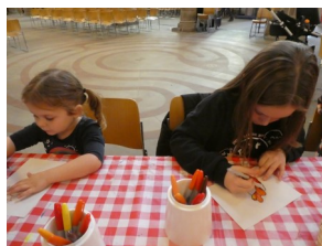
autumn leaf suncatchers