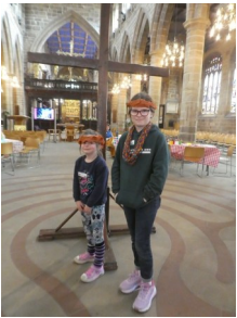
paper crowns of thorns

Our theme for April's Messy Cathedral was Holy Week and Easter. Crafts included making donkey models for Palm Sunday and paper crowns of thorns for Good Friday. They decorated plastic cups and planted date stones in them and made paper plate Easter gardens. They listened to the story of Holy Week and Easter and sang We have a king who rides on a donkey . A simple lunch was shared at the end of the session.