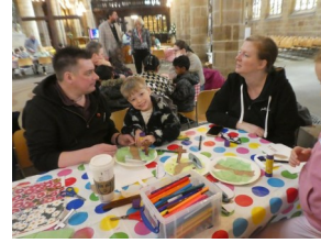
paper plate Easter gardens